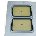
1/4 GN MOLD