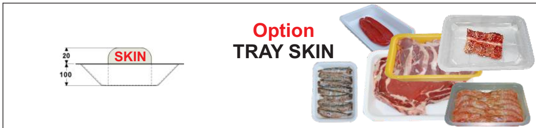
Option TRAY SKIN