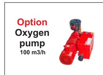
Option Oxygen pump 100 m3/h